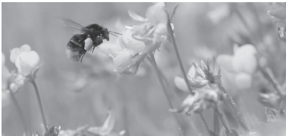
Red Tailed Bumblebee.

Late summer is a good time to look for wild bees that may be visiting your garden. This year, Wild About Gardens, a partnership between The Royal Horticultural Society and The Wildlife Trusts, is calling on people to bee-friendly in their gardens. Our gardens have immense value for wildlife. Each patch is part of a network of 15 million gardens that criss-cross the UK, which, put together, cover 667,000 acres – an area seven times the size of the Isle of Wight.