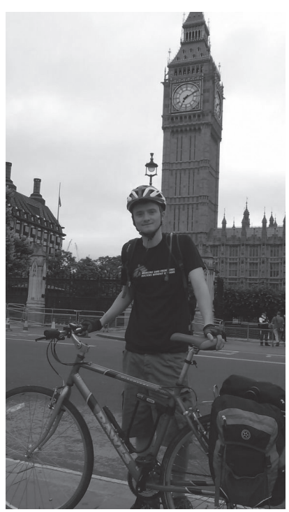
As the proverb goes: a journey of 2000 miles starts with a single tweet

Will's original target was £500 but at the time of writing he was up to £1,114 and still counting! If you would like to help, donating is very easy. Just text MSFW89 £..