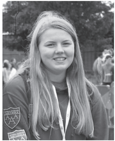
Catch up on Kate Carmichael's sporting exploits on Page 10