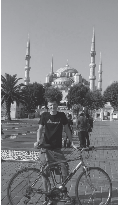
After a 24 days and 3300km I've arrived in Istanbul.