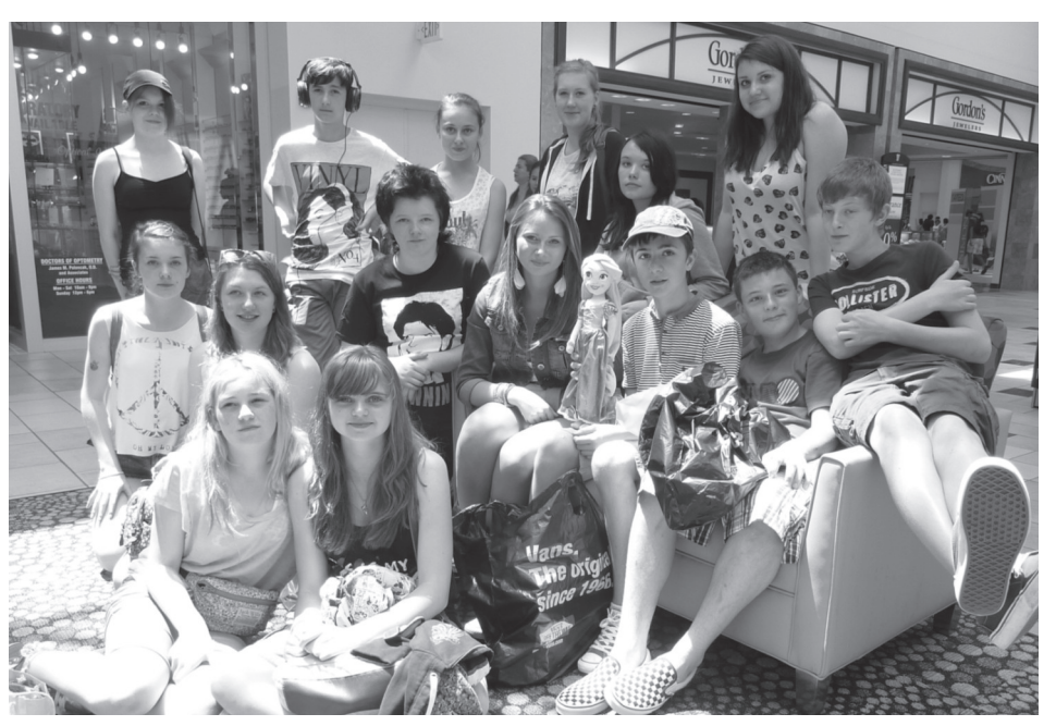
Above: relaxing before the flight home

Find out all about events, activities and trips available to 13-19 year olds in the Sedgefield, Fishburn, Trimdon and surrounding villages.