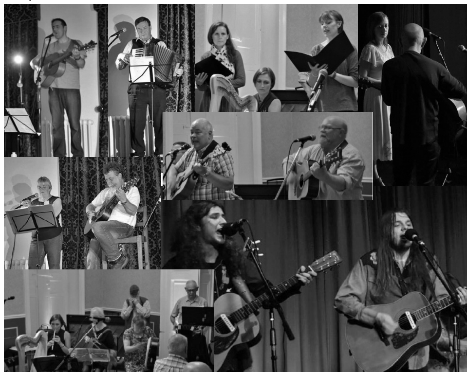
Pictures above from a range of the events at Sedgefield Folk Festival