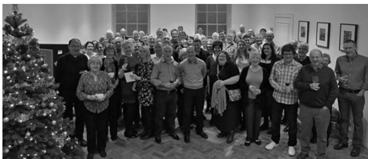
The representatives of Sedgefield's voluntary groups at the 2015 bash.

The event attracted around 80 volunteers, representing many groups from the community. The 2016 celebration will be held on the evening of Thursday 8th December, in the Manor House and full details will be released in due course. SVG does have a list of groups that it plans to invite, but doesn't want to omit any, so if you think that any may have missed out last year, please send details to sedgefieldvillagegames@gmail.com