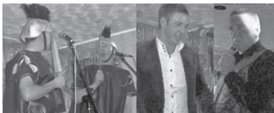
Some past performers

"The show is basically just about a good night out and raising some money for charity along the way. In its time the show has developed, changing its character from year to year. It started life as a talent competition but has now become a fun-time variety show and has lost its competitive nature."