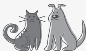
Butterwick Doggy Daycare

This month's Community Stall is St. John Ambulance. There's no music this time, but we look forward to lots of Festive singing during our Christmas Market on 2nd December.