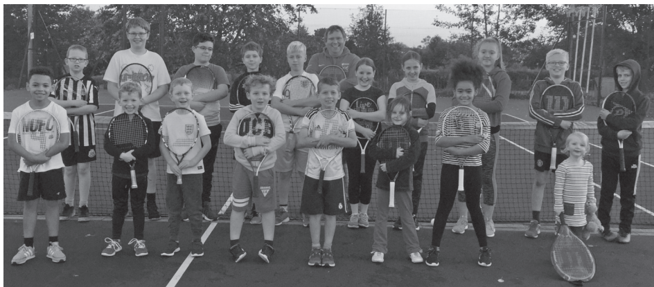
Young players at Sedgfield Tennis Club

Autumn is upon us – the season of mists, mellow fruitfulness and muddy sports kit. Once again, we have a bumper line-up of sports news from the younger generation, and you can find more of that, and updates from Sedgfield's equally sporty adults on www.sedgfieldweb.co.uk .