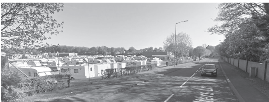
The present scene approaching Sedgfield from the Community Hospital roundabout, with below, an artists impression of the same view after the housing is built.