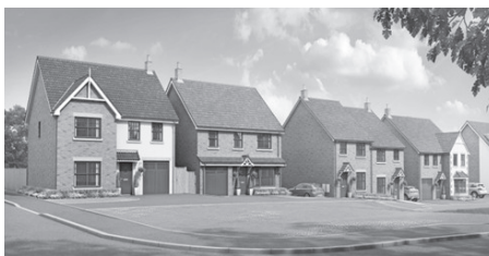
Artist's impression of the Eden Drive development street scene

These houses are part of phase 1 of the development. The first completions in phase 1 will take place in early 2018 and the builders are on target to open their show home at the end of January in the New Year. It is intended that the whole of the first phase will be completed by 2019/20. This first phase will provide 4 five bedroom detached houses, 22 four bedroom detached, 10 three bedroom semi detached, 8 two bedroom linked or semi detached and 1 three bedroom dormer bungalow – 45 houses in total.