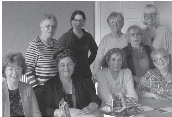
Performers, authors, organisers & participants are pictured at the first Bookends festival.