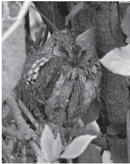
Wonderfully camouflaged - the Scops Owl

Again instructions on how to make and where to erect a Barn Owl nest box can be found on the BTO website. More information about the River Tees Rediscovered project can be found on their new website www.riverteesrediscovered.org/