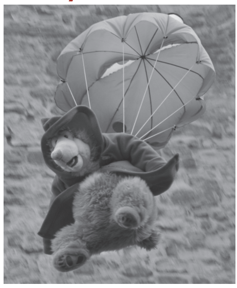
...but all in a good cause. See p 7