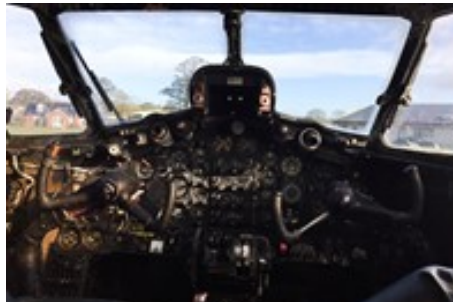
Top, the cockpit of the De Havilland Dove. Below, the Sea Vampire

There was an optimistic tone to the Chairman's report to the AGM of Sedgefield Development Trust at the end of a successful year. Most projects are ticking over nicely and others, both old and new, have seen astonishing growth. Also, with new trustees making their mark, some recent ventures are striking a chord with children and young people. For the future, ideas on sustainability are being developed. Why not join us? Project reports on p11.