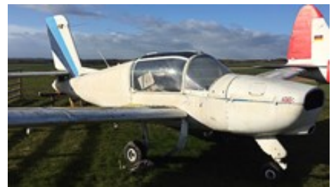
The Rallye light aircraft

Under expert guidance , the younger members of the group are working to restore a Rallye light aircraft - a great project to join for young people thinking of a career in engineering.