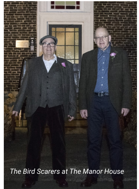
The Bird Scarers at The Manor House