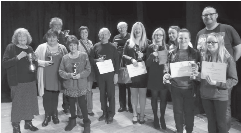
The Players, SPYS and their awards.