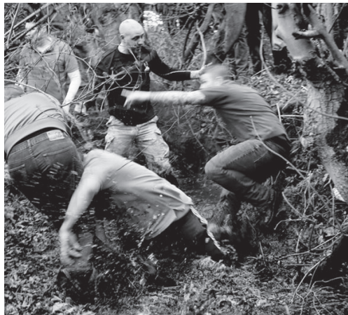
Sedgefield ball game 2016 Playing to win!

Produced by volunteers for the people of Sedgefield, Bradbury, Mordon and Fishburn