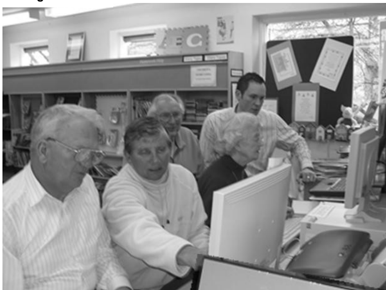
A drop-in session in progress at Sedgefield Library

Attendance at the training sessions is picking up as people realise that it is available.