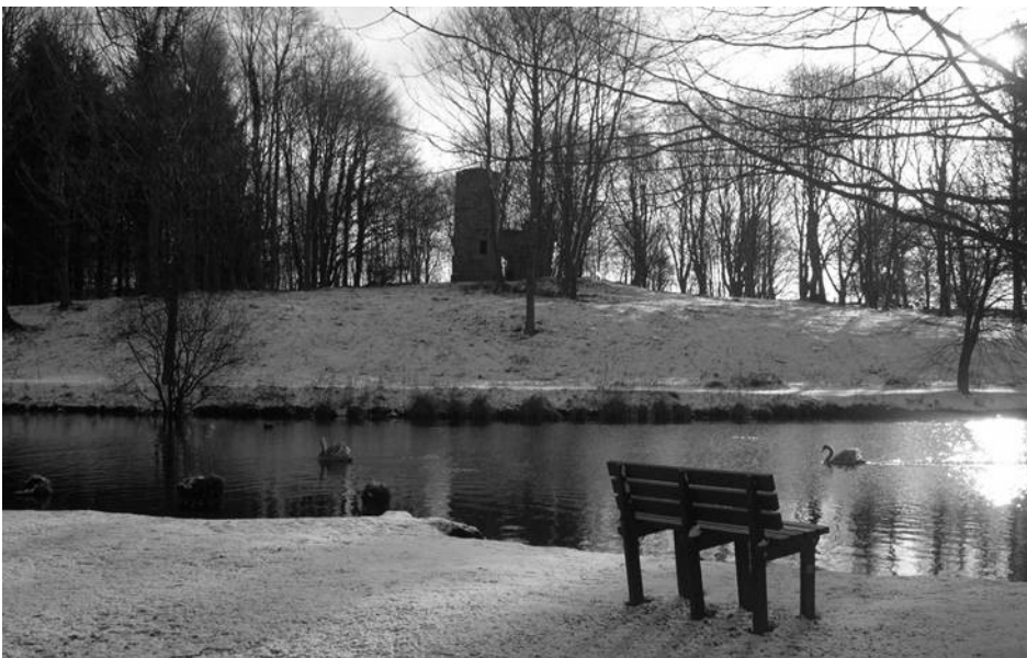
A new vista opens up - the Gothic Ruin on a winter's morning