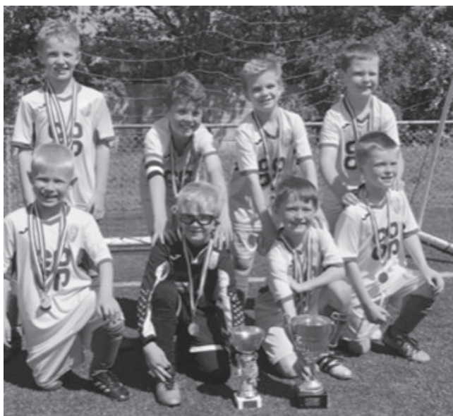
The double winning Sedgefield Youth FC U8 team with their trophies