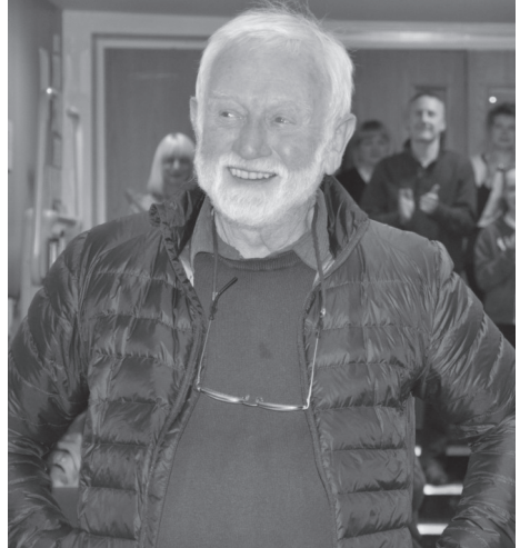
A picture of surprise & delight!

In an increasingly inactive society, Sedgefield can be proud of the huge variety of active pastimes available within the community. Sedgefield Village Games aims to ensure that generation after generation is inspired to lead healthy lifestyles and this month's 2016 festival can play an important role in that. It should also be great fun for children and parents alike, so please get involved! See page 6 for details.