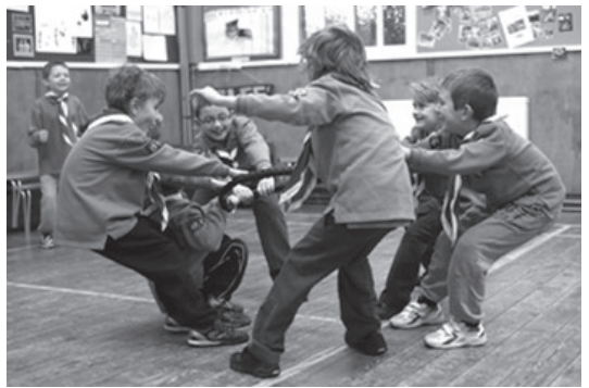
1<sup>st</sup> Sedgefield Scout Group has contributed a huge amount to our community. Let's help make 2016 a great celebration of the last 50 years and a platform for the next 50!