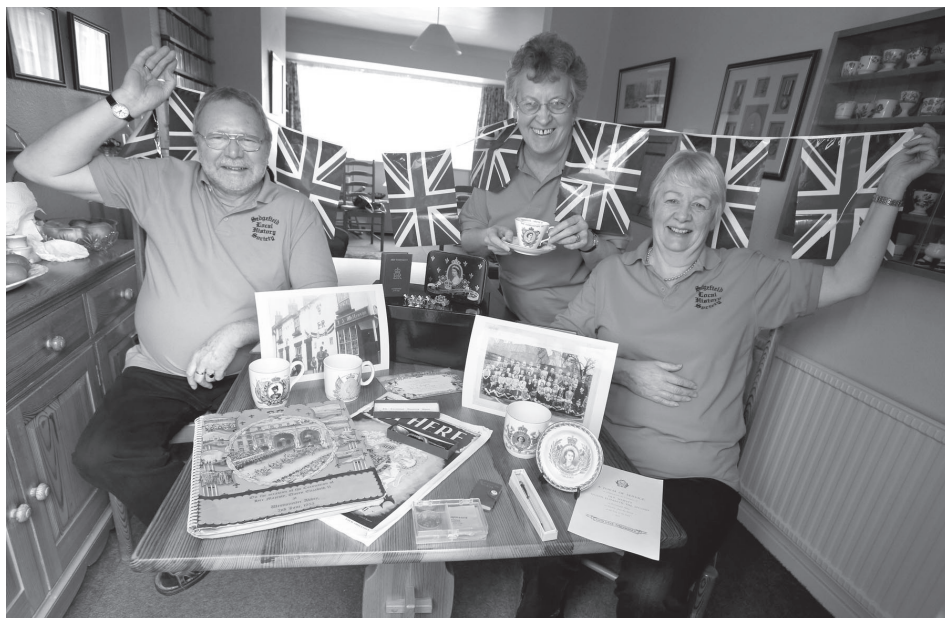
Just follow the bunting to the Coronation Exhibition on Saturday 1st June! See centre pages for all your June events