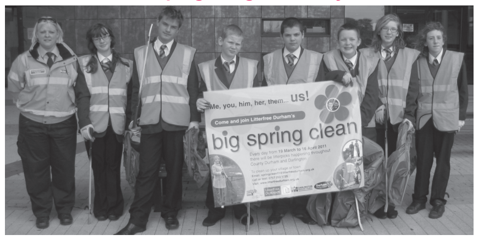
Some of the Year 9 students from Sedgefield Community College who kindly volunteered to participate in one of the college community projects. Together with Durham County Council Civic Pride Trust, Sedgefield in Bloom, Neighbourhood Wardens and other members of our local community, they spent two hours tidying up our Village Green, as part of a community effort.