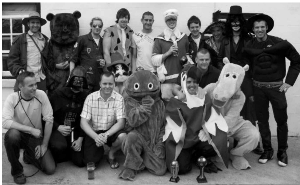
As they opened the kit bag at their next game, Crosshills FC started to doubt the wisdom of signing a sponsorship deal with a fancy dress outfitter.