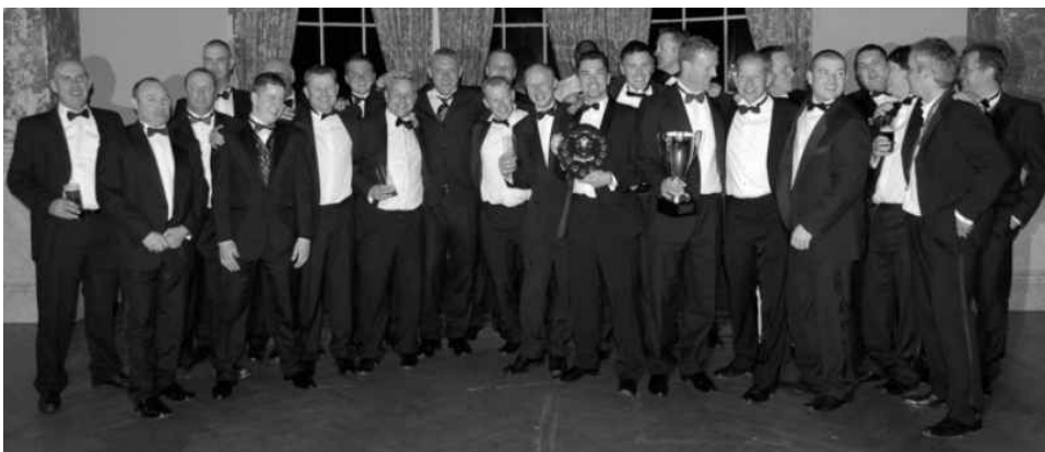
At the Rugby Club's presentation night.