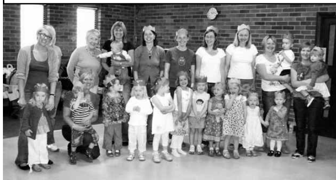
The Wigglets Tuesday 9.30am class - with their party hats on!

Line Dancing is at the usual time of 12.00 in the Parish Hall, before the 'party'.