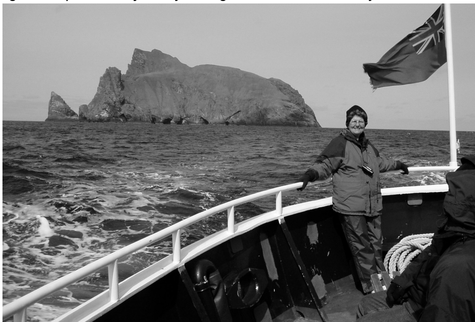
On the Elizabeth G, approaching Boreray - a petrified monster of a St Kildan island!