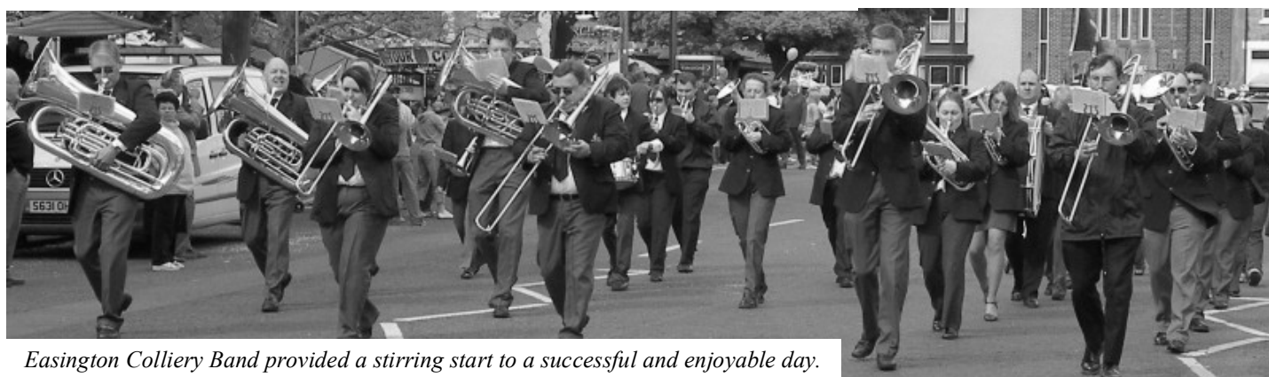
Easington Colliery Band provided a stirring start to a successful and enjoyable day.