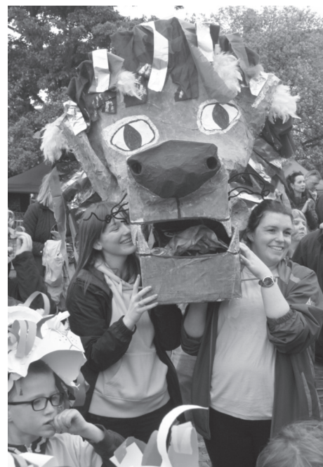
See another fantastical creature from the Fayre on page 11.