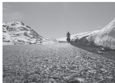
William's long ride. See page 3