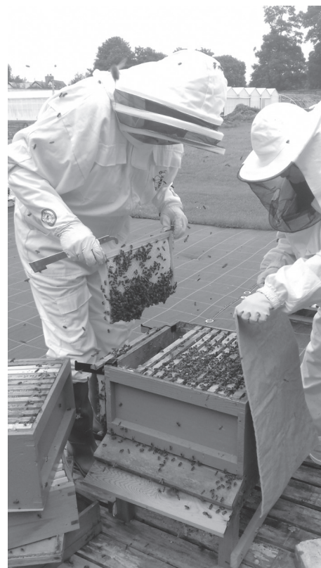
"Looking for the Queen."