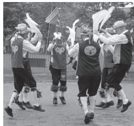
Hankies & feet took flight at the Mediaeval FayRe. SCA report on page 5