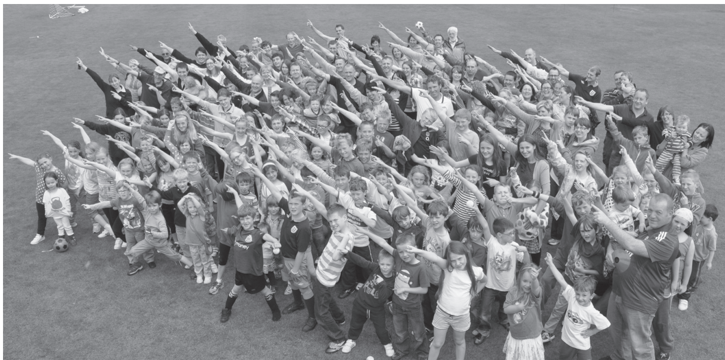
Sedgefield Village Games gets into the Olympics spirit with a mass Usain Bolt pose. Can you find yourself?

One of the most popular events that SVG hosted in 2012 was a family fun and games afternoon at Sedgefield Cricket Club.