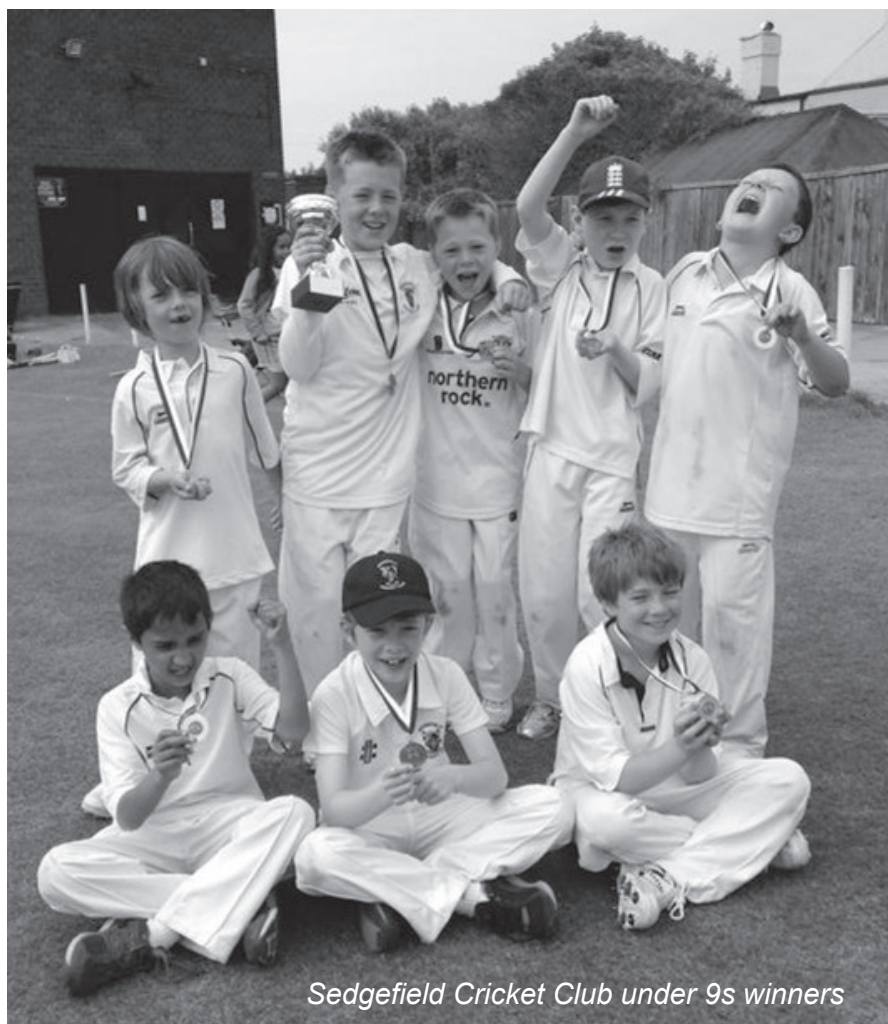
Sedgefield Cricket Club under 9s winners