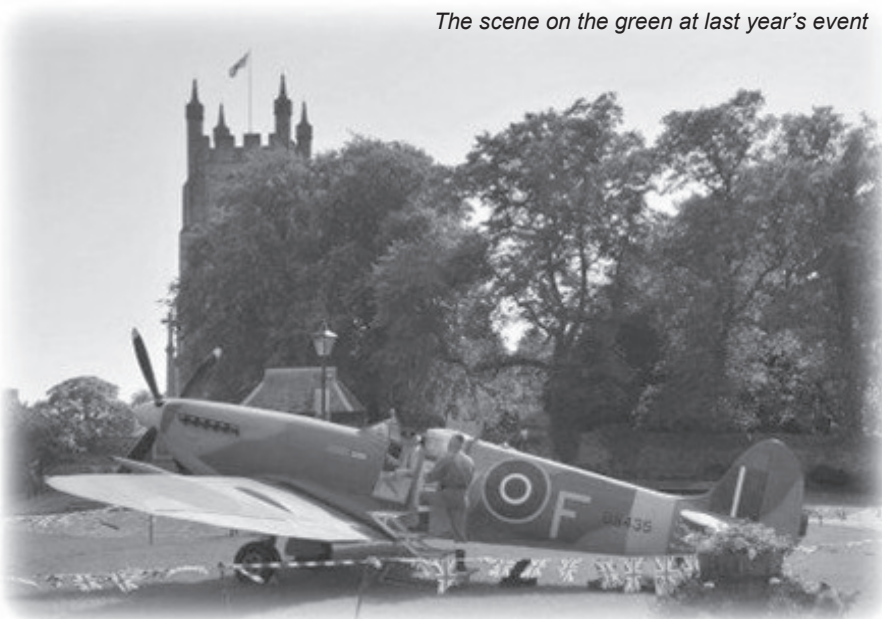
The scene on the green at last year's event

Despite a disappointing turnout for June's Crimean War Re-enactment weekend, the Veterans are busy again. As this paper is being distributed they are out on the Green again, this time for a first World War event to celebrate Armed Forces Day, on 29th & 30th June. Then, scarcely pausing for breath, they are back with a second Spitfire on the Green 1940s weekend from 19th - 21st July. Last year's first Spitfire event caused astonishment in the High Street as people realised what was going on, but this time we can anticipate it with pleasure and get out in time to support the event. Alongside the Spitfire will be an Auster spotter plane and an extensive selection of Military Vehicles. Re-enactment groups will be on hand to share their knowledge of both military and civilian experiences, with discussions and demonstrations throughout. So join the veterans for a weekend recalling the memories, daily life, music and style of the forties!