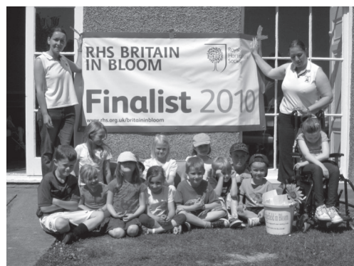
Sedgefield Fun Club at the Blooming Marvellous treasure hunt in Ceddesfeld Hall