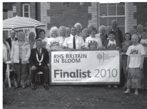
Outside the police station with volunteers and visitors to the Blooming Marvellous Coffee morning