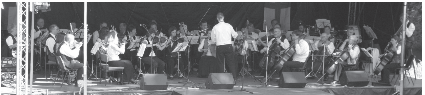
Members of the Cobweb Orchestra (above) and local favourites, the John Wrightson Band, entertained an appreciative audience at this year's Prom in the Park, in the grounds of Ceddesfeld Hall

The next big event at Ceddesfeld Hall is the Beer Festival on July 2nd and 3rd. With 12 real ales chosen by a CAMRA award winning bar, and live music - folk on Friday night and jazz on Saturday - it's the place to be for lovers of the real thing!