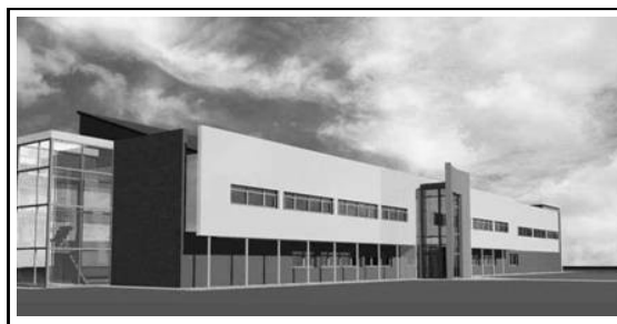
An architect's impression of the NetPark Institute