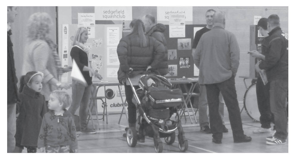
Above; some of the projects come under scrutiny