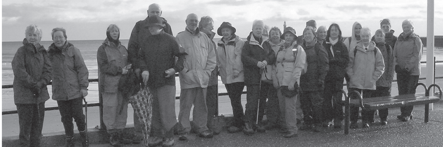
An enjoyable if blustery stroll along the coast was the latest away trip for the Sedgefield Walking Group.