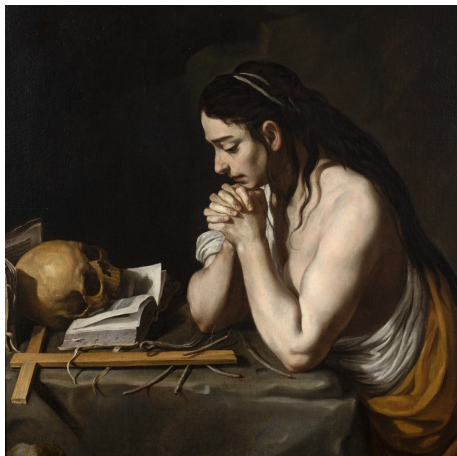
The Penitent Magdalene Oil on canvas c.1620, Luis Tristán de Escamilla