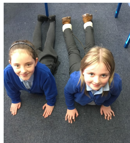
Year 5 creating the cobra

The children had obviously been on Santa's good list as he had also upgraded the internet connection to allow instant access to the appropriate apps used in school....which also pleased the teachers!