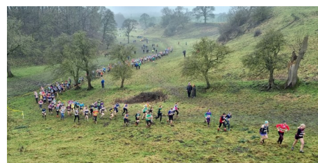
The senior women head for the first hill at Thornley Hall Farm

The latest cross country running fixture in the North East Harrier League was held just up the road at Thornley Hall Farm in early January. Thornley has a reputation for delivering plenty of mud and hills and it didn't disappoint, providing a proper test for all of the runners. Once again, Sedgefield Harriers sent a large squad of senior athletes and enjoyed a very successful day. The men convincingly won the fixture in their division and have a huge lead at the top of Division 3 with just one race to go. In fact, they have a perfect record so far this season, having won each of the five outings, which started back in September – a great, sustained effort. There were so many Harriers in action that a second full team from the club came seventh on the day too. The men will now be mustering to confirm promotion in the final race in Alnwick on 5 March. Meanwhile, the senior women also turned out in force at Thornley and came third on the day in Division 3.