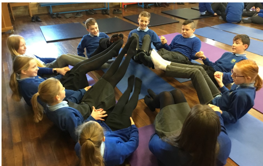
Balanced team support in Year 6.

Pupils thoroughly enjoy the calmness and collaborative teamwork involved in these sessions.