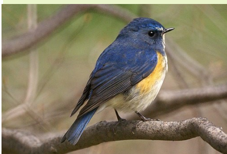
Red-flanked Bluetail, M.Nishimura

Of course, with a year tick list common birds like House Sparrow are every bit as important as a Red-flanked Bluetail (yes they do exist!). The Red-flanked Bluetail is by far the best bird of the year so far, a little bit of a trek to see it but not too bad. The bird was spotted by the River Tees at Bowlees, not far from Low Force and was present for quite a few days (it may be still there). Only a short distance from the car park along a muddy path, we arrived to find around a dozen or so people watching this rather pretty little bird hopping along the ground and on fallen trees whilst bobbing its tail up and down, looking for insects and berries. It used to be thought of as a member of the Thrush family but is now classified as an Old-World flycatcher; it and related species are often called chats.