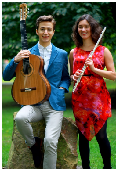
The Meraki Duo