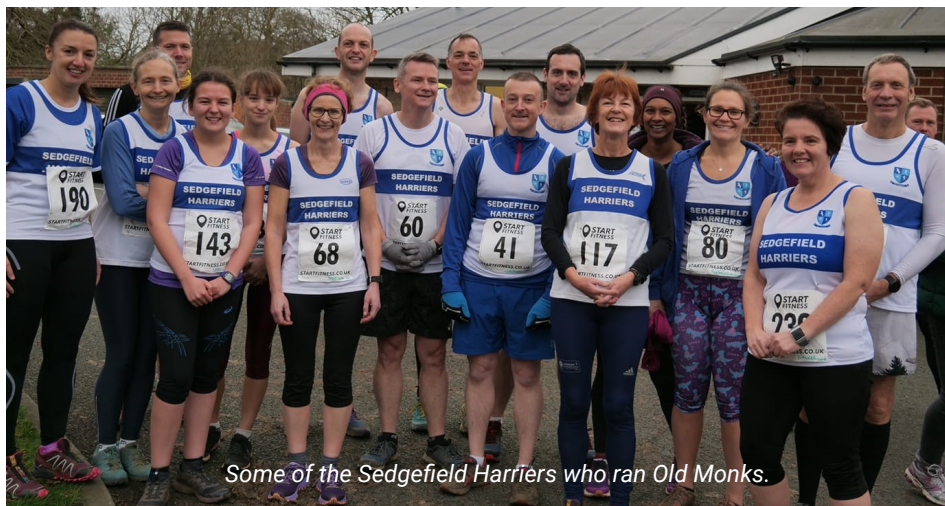
Some of the Sedgefield Harriers who ran Old Monks.