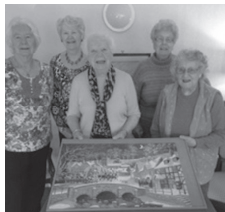
Meet the Homebryth Jiggers! They had great fun putting this jigsaw together

Open to anyone with an interest, or a need to share a performance with a willing and excited audience! If you can sing, play guitar, recite poetry, tell stories, perform a stand up routine, then we would be thrilled to hear you. It's £3 for a ticket and free to perform. A mic, amp and piano will be provided and the bar will be open. For tickets please call 622185 or email diary.sedgefieldnews@hotmail.com TG