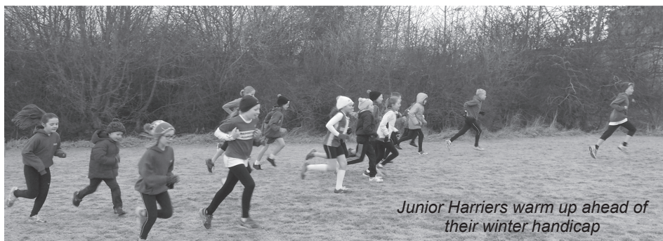
Junior Harriers warm up ahead of their winter handicap

The senior winter handicap was preceded by a junior race which saw girls and boys up to the age of 10 tackle a shorter circular route. This race was held before the sun broke through the mist and clouds, so the conditions were even colder than for the adults. As usual, this race was also well supported, with some great running from the youngsters.