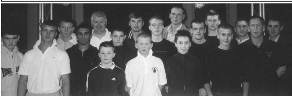
These local boxers are giving us plenty to be proud of. See Sports Update, p.6

* Including Education in the Community, Bishop Auckland College, WEA, Leap, Learn East, New College Durham, East Durham & Houghall, Cavos and others.