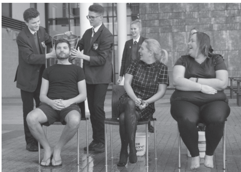
All part of the fun! Children in Need fundraising at Sedgefield Community College

our areas. Rural communities are our eyes and ears and we encourage everyone to report crime and suspicious incidents. Police and Farmwatch volunteers will continue to work together to keep rural areas safe by giving out security advice, sharing information on a day-to-day basis and taking part in future operations."