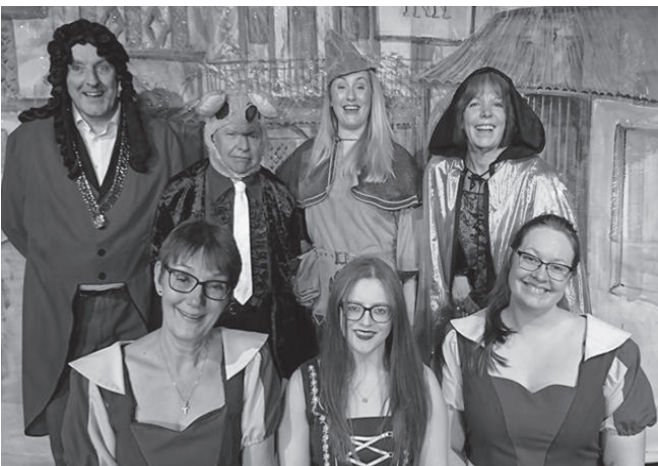
Players in rehearsal.