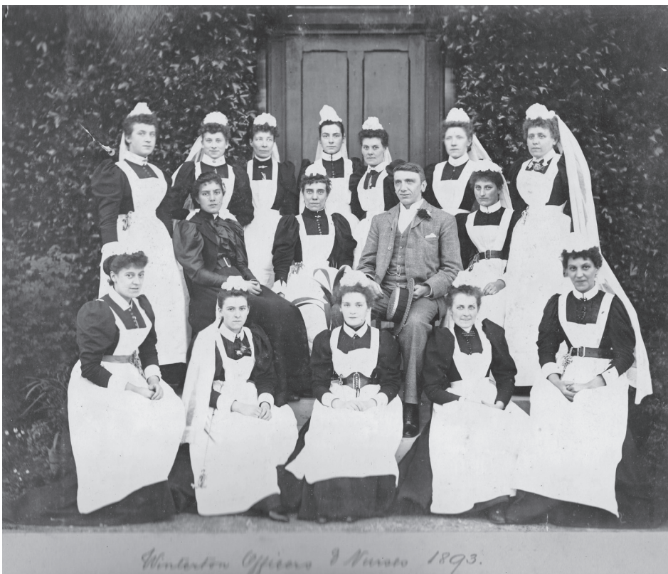
Winterton Officers & Nurses 1893.