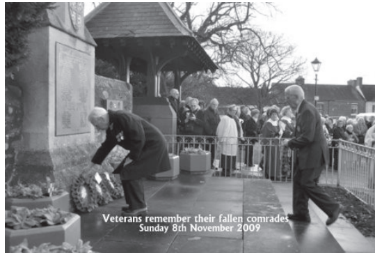
Veterans remember their fallen comrades Sunday 8th November 2009

The month of November is especially important to those who have served in conflict for our country and for the loved ones who have lost family in the service of our country. Neighbourhood Watch in Sedgefield have for many years supported this important day in the lives of many of their members by providing wreaths at the Cenotaph on the village green and at the Cross at Winterton.