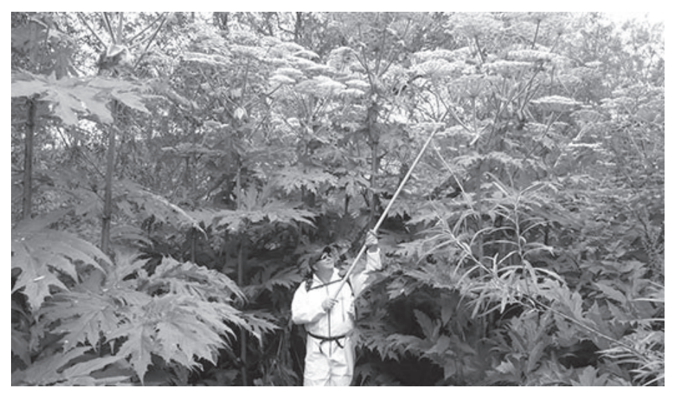
The scale that's possible when Giant Hogweed becomes established!

This is just one of the jobs that Wildlife Trust staff (not volunteers) have to do to ensure our reserves are safe and accessible. But we have lots of other tasks that we must do and involve our many volunteers in doing them. Both Tees Valley and Durham Wildlife Trusts have various opportunities for volunteers and we can't really survive without them. From charity trustees to data in-putters, from butterfly surveyors to litter pickers, from dry stone wallers to footpath builders - they all play their part. Volunteers not only help the Trusts to achieve their aims they also gain as well. Research has shown that volunteers benefit in a number of ways; from making new friends, working as part of team and the opportunity to spend some time outside enjoying nature. If you are interested in getting involved why not contact your local trust and see how you might help.