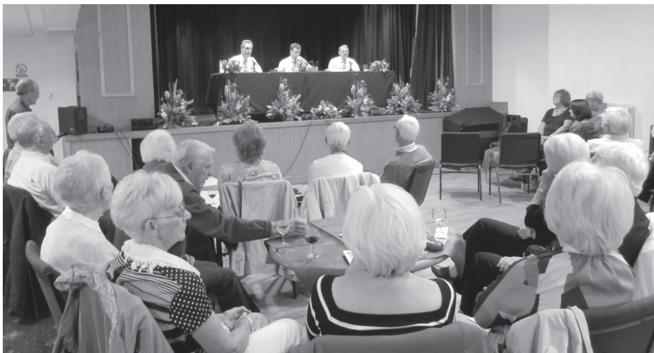
Audience and panel at Gardeners' Question Time

Britain in Bloom judges visit on Monday 4th August, following Northumbria judging in July. The results are not announced till September and October, so fingers crossed till then!