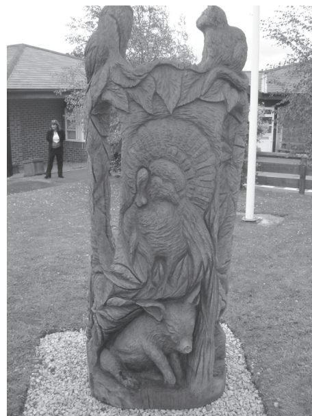
The Storyteller's Chair