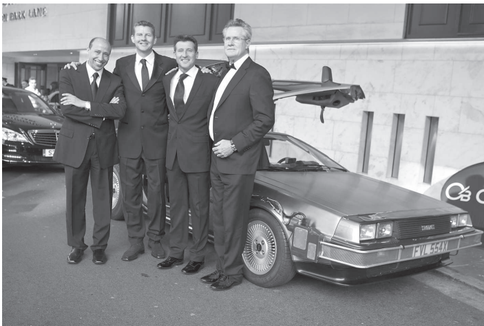
Aouita, Cram, Coe and Walker plus DeLorean

I was privileged to attend a very special event in July, down in London village. On 16 th July 1985, North East athlete Steve Cram set the first of three world records in just 19 days. In a remarkable sequence of races, Steve took the 1,500m, mile and 2,000m records, beating the times previously set by Said Aouita, Seb Coe and John Walker. This achievement is still regarded as one of the most impressive in athletics history and to celebrate its 25 th anniversary, a 'posh do' was held a few weeks ago. The guest of honour was of course Steve Cram, but Aouita, Coe and Walker were all there (together for the first time since the 1980s), along with other sporting stars such as Michael Johnson, Paula Radcliffe, Kelly Holmes, Sally Gunnell, Barry McGuigan and Daley Thompson. Even Des Lynam put in a typically smooth appearance and a Back to the Future specification DeLorean car added some Hollywood glamour to the evening (the film was released 25 years ago). The Jarrow Arrow (or more correctly Jarra Arra) was pretty much unbeatable back in 1985 and although Steve never claimed an Olympic gold during his career, he is quite rightly regarded as one of the greats of middle distance running, from an era dominated by Brits. Like almost every great athlete, his ascent to the top of his sport began at his local club,