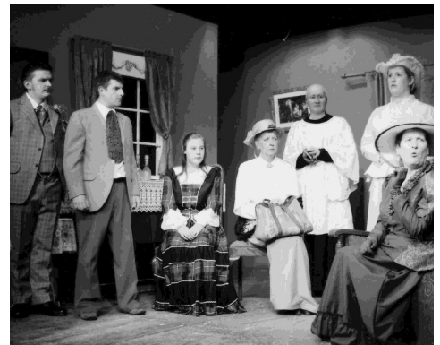
A scene from "The Importance of Being Earnest"

The camp fire gets going—led by Heather Cummings