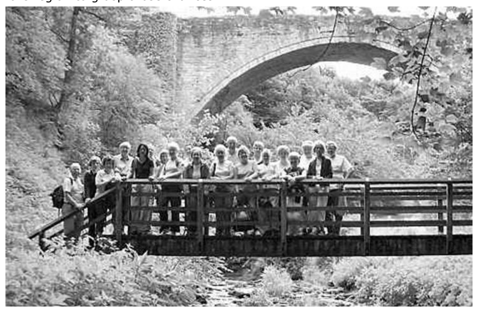
Sedgefield Walking Group enjoying the view at the spectacular Causey Arch during their June walk

P.S. Yes, I know I promised a cricket update this time. I have made some progress on that front and there will be a 'cricket special' next month, including news of a great cup run by Sedgefield Cricket Club.