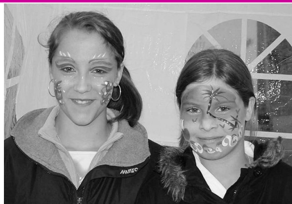
Above: Magic faces bring a sparkle to the day while below, it's down to business on the quoits pitch

Since the Queen's Jubilee in 1977, Bradbury & Mordon Village Hall Association have held a barbecue almost every year. This time they broke with tradition to try a Hog Roast instead.