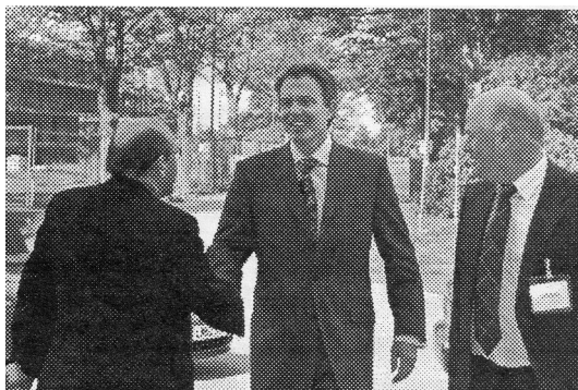
Prime Minister Tony Blair is welcomed to the leafy surroundings of NetPark where he introduced the new Vision for County Durham. Below: all round delight at the handover of the Research Institute.

The Centre for Advanced Instrumentation (CfAI) has an international reputation for the design and construction of novel instruments for optical and infrared astronomy and works with observatories around the world to improve the quality of astronomical imaging and observation. The IADET project meanwhile is involved in harnessing the latest developments in computer modelling, graphics and information management, which would help businesses to improve their competitiveness.