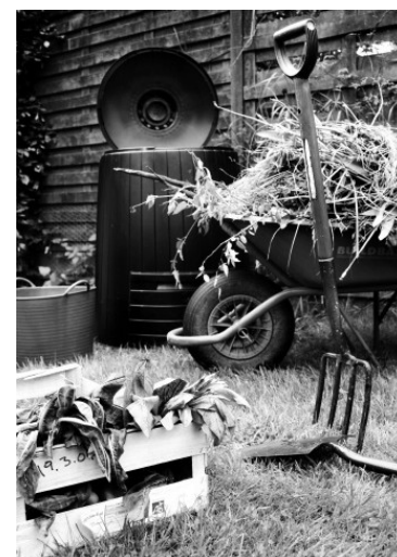
Home Composting Day at Trimdon - Entry free & open to all see p.11 for details)

Entries closed on 30 July but you can contact the secretary, Mr B Woodward, on 620431 for information. Details on p. 11