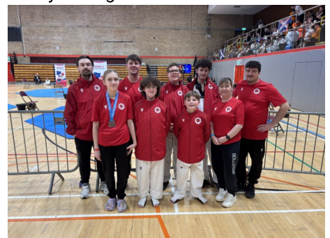
The Blade Taekwondo team brought home five medals from the Ultimate North East Open Championships

Blade Taekwondo runs its sessions in Bishop Middleham Village Hall on Mondays from 7-8pm and Saturdays from 10-11:30am. Anyone wanting to join Blade Taekwondo or try a free session can contact the team on bladetaekwondogbr@gmail.com or by calling 07923 951681.