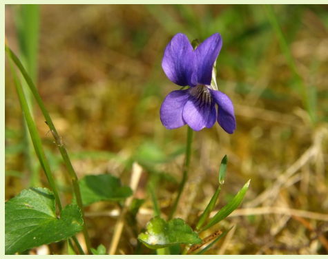
Common Dog Violet by David Baird

Not only are violets beautiful they are vital to some of our most spectacular insects. If you see a violet in the wild, it is most likely to be the Common Dogviolet. This widespread plant lives happily in many different habitats, including woodland, grassland, heathland, hedgerows and old pasture. They are in flower from April to June. Dog violets are small, perennial flowers which grow up to 15 centimetres in height. The leaves are heart-shaped and dark green in colour and the flowers have five striking purple petals that overlap each other