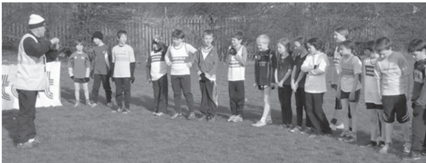
Harriers juniors among the field for the start of the U11 cross country at Blakeston School on Feb 7 th - a cold day!