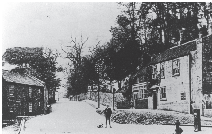
Houses before conversion.