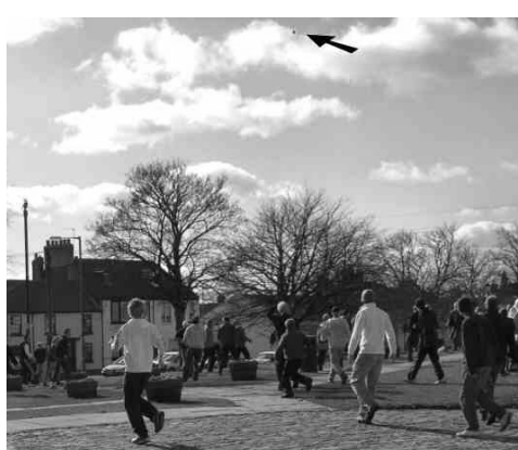
Spot the ball - an unusual sight in the Ball Game