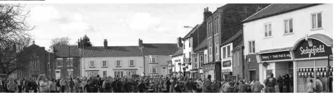
Right: Determined to be in at the start!

Proceeds go to the Village Hall funds. Special thanks to parents and friends, without whom the show could not have gone on.