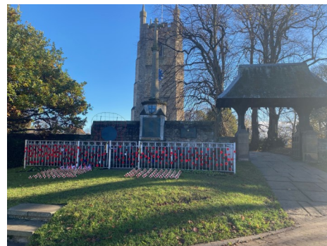
Thanks to the SCA Craft Club for the poppies for the Remembrance Memorial Garden