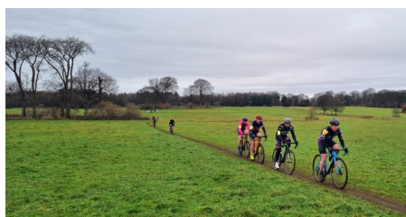
Cyclo-cross riders in action in East Park last year

The action in Sedgefield will start with races for under 8s, 10s and 12s at 12 noon. The under 14s and under 16s will start at 1:00pm and the senior and veteran men and women will set off at 1:02pm. If you fancy trying cyclo-cross, it's not too late to enter. You will need to be a member of TLI Cycling (£20 per year – join at www.tlicycling.com ) and race entry is £4 for juniors and £10 for seniors and vets. Find out more on the Facebook page NECCL - 'North East Cyclo Cross League' .