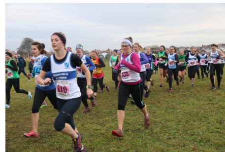
The women's race in Sedgefield in 2021

Sedgefield will host a major event on the winter athletics calendar early next year. Northern Athletics has announced that the 2024 Start Fitness Northern Cross County Championships will be held in East Park on Saturday 27 January, with over 2,000 runners expected to participate.