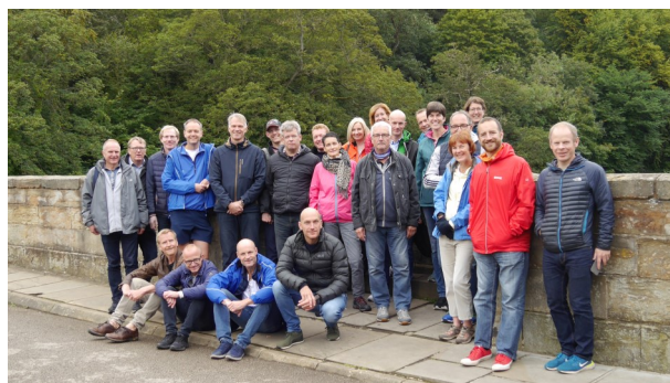
Twin running clubs at Prebends Bridge, Durham

Many strong friendships have grown up around the Twinning exchange and various groups have contributed to or made their own exchanges, for example the Scouts who were often involved in the early years and the Sedgfield Harriers have recently made successful exchanges.