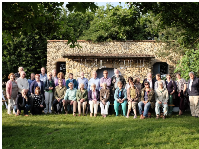
Twinnings at Kloster-Kraul

Finally, in celebration of the Twinning Association's 40th anniversary, a special "German Bierfest" event is being held at Ceddesfeld Hall on 24 September. The event is open to everyone, although numbers are limited, so be sure to book early. Details on page 8.