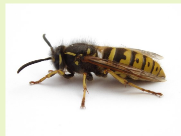
Social wasp

And wasps! Well, they do have a bad reputation which I think is undeserved. There are a staggering 9000+ species of wasp in the UK. The vast majority of these are small and solitary insects that largely go unnoticed by us. Then there are hundreds of wasps that don't even sting. I know that when most people think of a wasp you think of the larger black and yellow versions, we have 8 species of these social wasps in the UK. They live in colonies and construct magnificent nests out of chewed up wood pulp. Wasps fill a number of niches in the ecosystem. Our social wasp, for example, are predators, hunting insects and spiders, they chop them up and feed them to their larvae. It has been estimated that social wasps account for 14 million kilograms of invertebrate prey across the summer—that's what I call natural pest management. The larva will reward the worker wasp with a sugary solution when the colony is young, but in August when most of the larva have left the nest, the males must get their sugar from somewhere else. Yes, that's correct, that is when they start to invade our space and our sugary drinks. So, remember craneflies are harmless and wasps eat lots of pests!