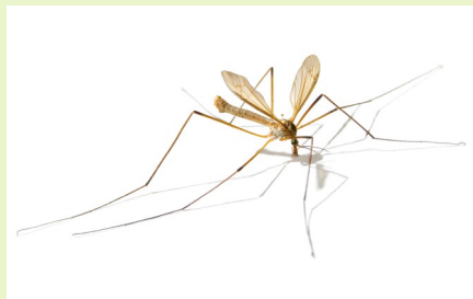
Crane fly ( neurovelho , CC BY-SA 3.0)

A recent Facebook post from Buglife highlighted the fact that at this time of the year we see lots of stories in the media demonising certain species of insects and an article in WildTees, the Tees Valley Wildlife Trusts' magazine entitled "What is the use of wasps", got me thinking how the media can influence people's opinion.