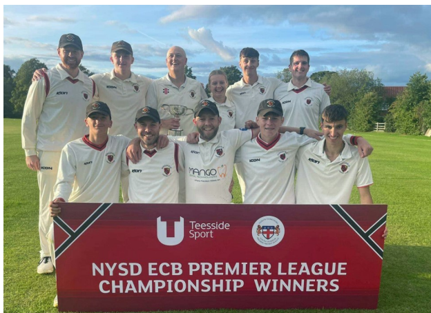
The triumphant Sedgefield Cricket Club 2nd XI

Meanwhile, the girls' U11 team also won their league, which is great testament to the hard work that the club has put into girls' cricket in recent years.