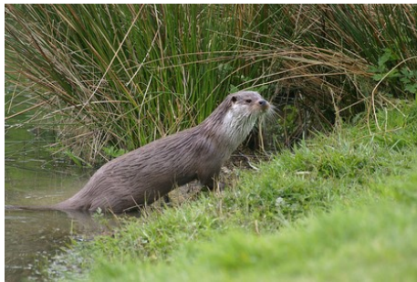
Otters were one of the species displaced

Durham Wildlife Trust has a vision for a Great North Fen. Restored landscapes where nature can recover and wetland habitats will sequester and store carbon. The Discover Bright Water Landscape Partnership began the first phase of the restoration of the Carrs, securing land at Bishop's Fen to the south of Bishop Middleham. Additional land has recently been acquired at Ricknall Carrs, near Newton Aycliffe.