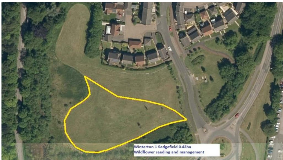
Winterton 1 Sedgefield 0.43ha Wildflower seeding and management

This project to enhance biodiversity contributes to actions that are addressing the ecological emergency that the council declared earlier this year, and will reduce the organisation's carbon footprint.