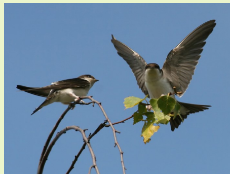
House Martins

We will now have to put up with the darker and cooler days of autumn and wait until next spring for the return (hopefully) of our House Martins. Talking of Autumn don't forget to check your bonfires for hedgehogs before you light them and remember that pumpkins are poisonous for hedgehogs so don't think you are doing good by leaving them out for them.