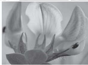
Clockwise from top right: Butterwort, Birdsfoot Trefoil and Common Spotted Orchid.

On one visit to Wingate Quarry, we came across an insect I had never seen before – we nearly stood on it! A black sausage shaped beetle with a bloated abdomen. On further investigation, using our field guide we discovered it was an Oil Beetle – so called because if attacked it exudes a toxic cocktail of oil which will deter most predators. With further research we found out that it has a complicated life cycle. The swollen abdomen is full of eggs and the females look for somewhere to dig a burrow to lay them in. When the hundreds of tiny larva hatch they look nothing like their parents; they are pale, thin and fast moving and immediately swarm up flower heads not looking for nectar but a lift. On each leg they have three hooks, and because of this are known as triungulins (from the Latin for three claws). They wait until a solitary bee comes along and then using their hooks they attach to the bee and hitch a lift back to their burrow. Here they eat the bees' eggs and feast on pollen before pupating and eventually emerging in spring. Oil Beetles are relatively rare so keep an eye out for them and if you find one let the Wildlife Trust know!