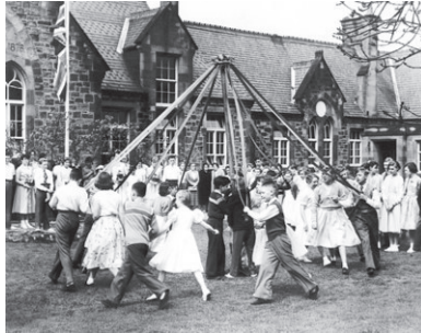
Children dancing many years ago

Please support the dancers and GNAAS - visit Sedgfield Farmers' Market on Sunday, 3rd May. Stalls open from 8.30am and there will be music